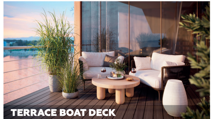
TERRACE BOAT DECK

The sun deck is the great place to spend the time in comfort sunbathing, enjoying the scenery or relaxing at the bar, the swimming pool will offer nice refreshment dip while variety of activities will keep you entertained.